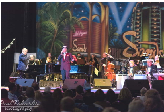
Sinatra's 100 th Birthday Party